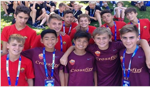
BU-14 DA in Madrid, Spain